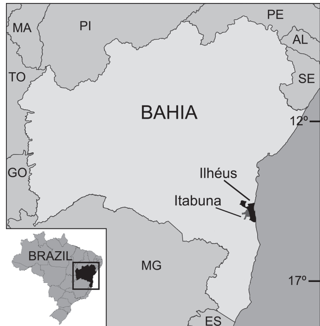
Figure 1 Map of Bahia state showing the known occurrences of Leiostracus onager (Itabuna) and L. subtuszonatus (Ilhéus). Abbreviations of neighboring states: MA, Maranhão; PI, Piauí; PE, Pernambuco; AL, Alagoas; SE, Sergipe; TO, Tocantins; GO, Goiás; MG, Minas Gerais; ES, Espírito Santo.

Since L. subtuszonatus was first described as a subspecies of L. onager and specimens available in museum collections are almost always of the latter, we suspected that these species could in