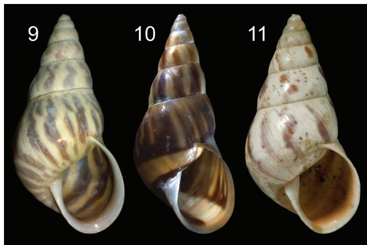
Figs 9–11. 9, Leiostracus onager (Beck, 1837), neotype (MZSP 29794; H = 25.5 mm, D = 12 mm); 10, Leiostracus subtuszonatus (Pilsbry, 1899) (MZSP 108040; H = 28.5 mm, D = 13 mm); 11, Leiostracus clouei (Pfeiffer, 1856), lectotype (NHMUK 1975491; H = 22 mm, D = 11 mm).