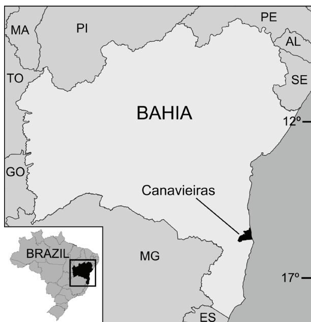
Fig. 1. Map showing the type locality of Leiostracus fetidus sp. nov., Canavieiras, state of Bahia, Brazil. Abbreviations of neighboring states: MA, Maranhão; PI, Piauí; PE, Pernambuco; AL, Alagoas; SE, Sergipe; TO, Tocantins; GO, Goiás; MG, Minas Gerais; ES, Espírito Santo.

Distribution. Known only from type locality, an Atlantic Rainforest fragment near the city of Canavieiras, state of Bahia, Brazil (Fig. 1).