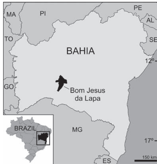
Fig. 1. Map showing the type locality: the municipality of Bom Jesus da Lapa, in Bahia state. Abbreviations of neighboring states: MA, Maranhão; PI, Piauí; PE, Pernambuco; AL, Alagoas; SE, Sergipe; TO, Tocantins; GO, Goiás; MG, Minas Gerais; ES, Espírito Santo.