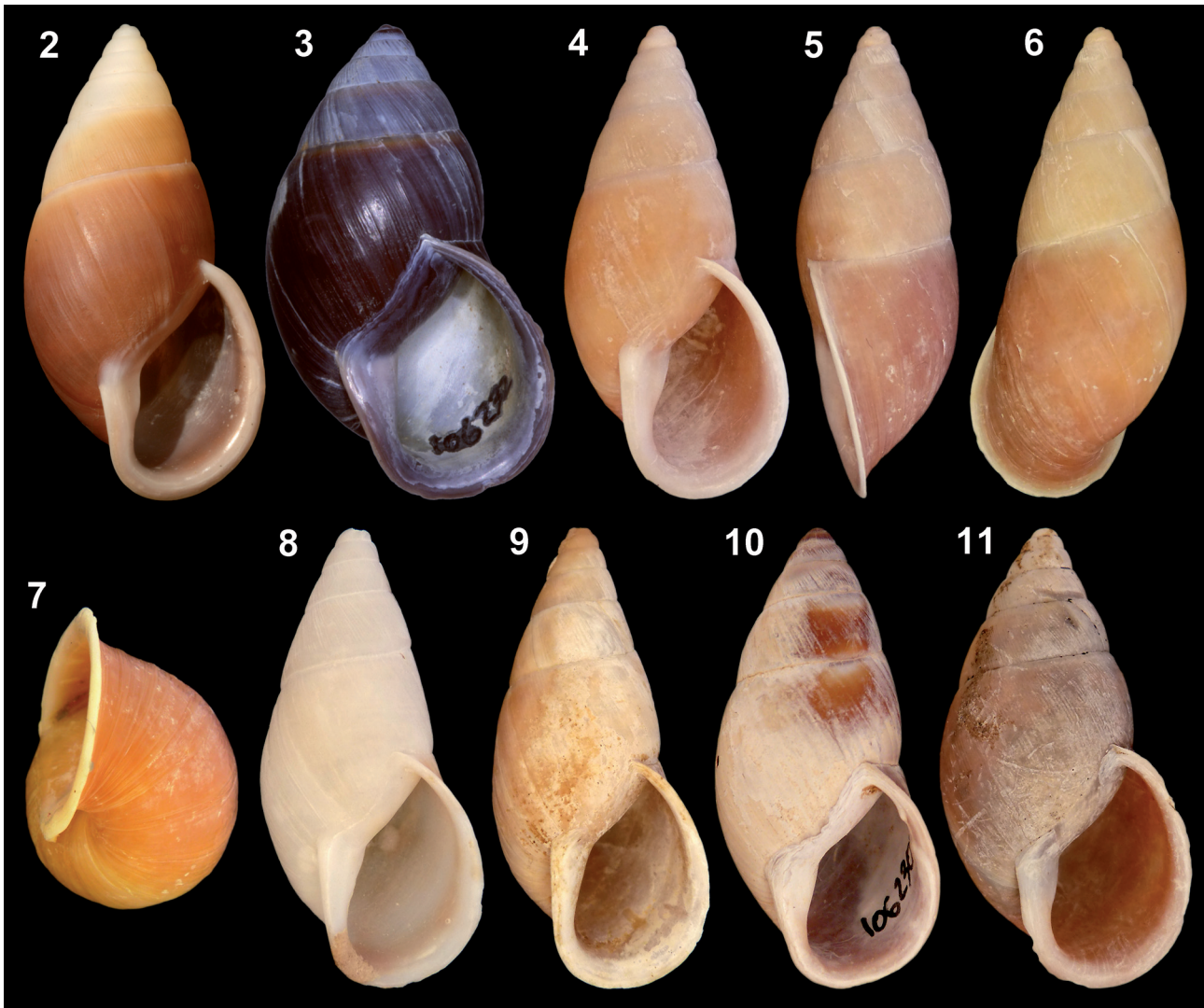
Figs. 2–11. Kora spp. from Bahia state, apertural (2–4, 8–11), umbilical (7), lateral (5), and dorsal (6) views. – 2. K. corallina (holotype, MZSP 103910; H=43.4 mm). 3. K. nigra (holotype, MZSP 106232; H=30.1 mm). – 4–7. K. rupestris n. sp. (holotype, MZSP 121416; H=37.7 mm). – 8. K. rupestris n. sp. (paratype #1, MZSP 121441; H=35.5 mm). 9. K. rupestris n. sp. (paratype #2, MZSP 121441; H=33.3 mm). 10. K. rupestris n. sp. (MZSP 106230; H=34.2 mm). 11. K. rupestris n. sp., apertural view (MZSP 107996; H=35.6 mm).