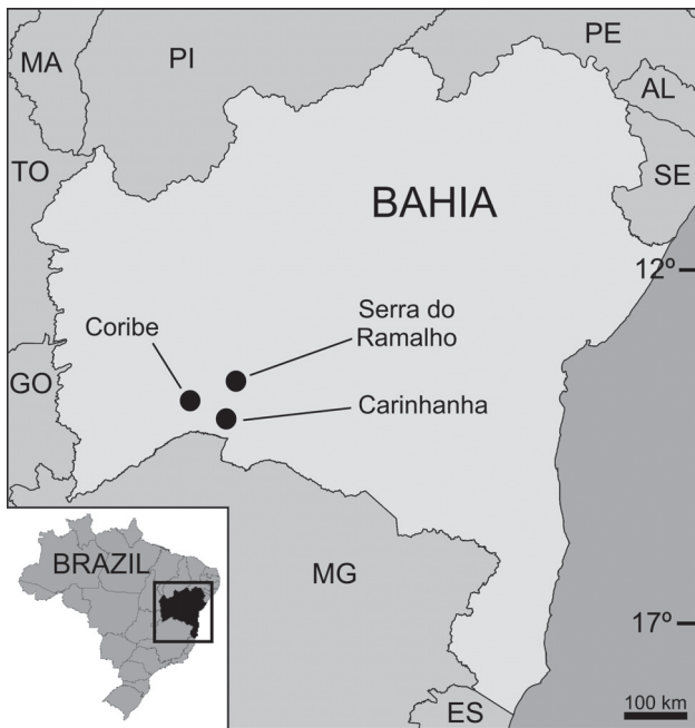
Fig. 1. Map showing the presently known distribution of Kora rupestris n. sp., the municipalities of Carinhanha (type locality), Serra do Ramalho and Coribe. – Abbreviations of neighboring states: MA, Maranhão; PI, Piauí; PE, Pernambuco; AL, Alagoas; SE, Sergipe; TO, Tocantins; GO, Goiás; MG, Minas Gerais; ES, Espírito Santo.

corallina : MZSP 103910 (holotype; Bahia state, Santa Maria da Vitória); MZSP 103911 (paratype; from type locality); MZSP 103912 (paratype; from type locality); MZSP 103913 (paratypes; 32 shells; from type locality); MZSP 104033 (> 50 shells; from type locality); MNHN IM-2012-37362 (paratypes; 2 shells; from type locality); MNRJ 30377 (paratypes; 2 shells; from type locality); USNM 1157009 (paratypes; 2 shells; from type locality). – Kora iracema : MZSP 104964 (holotype; Bahia state, São Desidério). – Kora nigra : MZSP 106232 (holotype; Bahia state, Serra do Ramalho); MZSP 104839 (paratypes; 5 shells; unknown provenance, but likely from type locality); MZSP 106241 (paratype; from type locality); MZSP 106250 (paratypes; 2 shells; from type locality). – Kora terrea : MZSP 106215 (holotype; Minas Gerais state, Presidente Olegário).