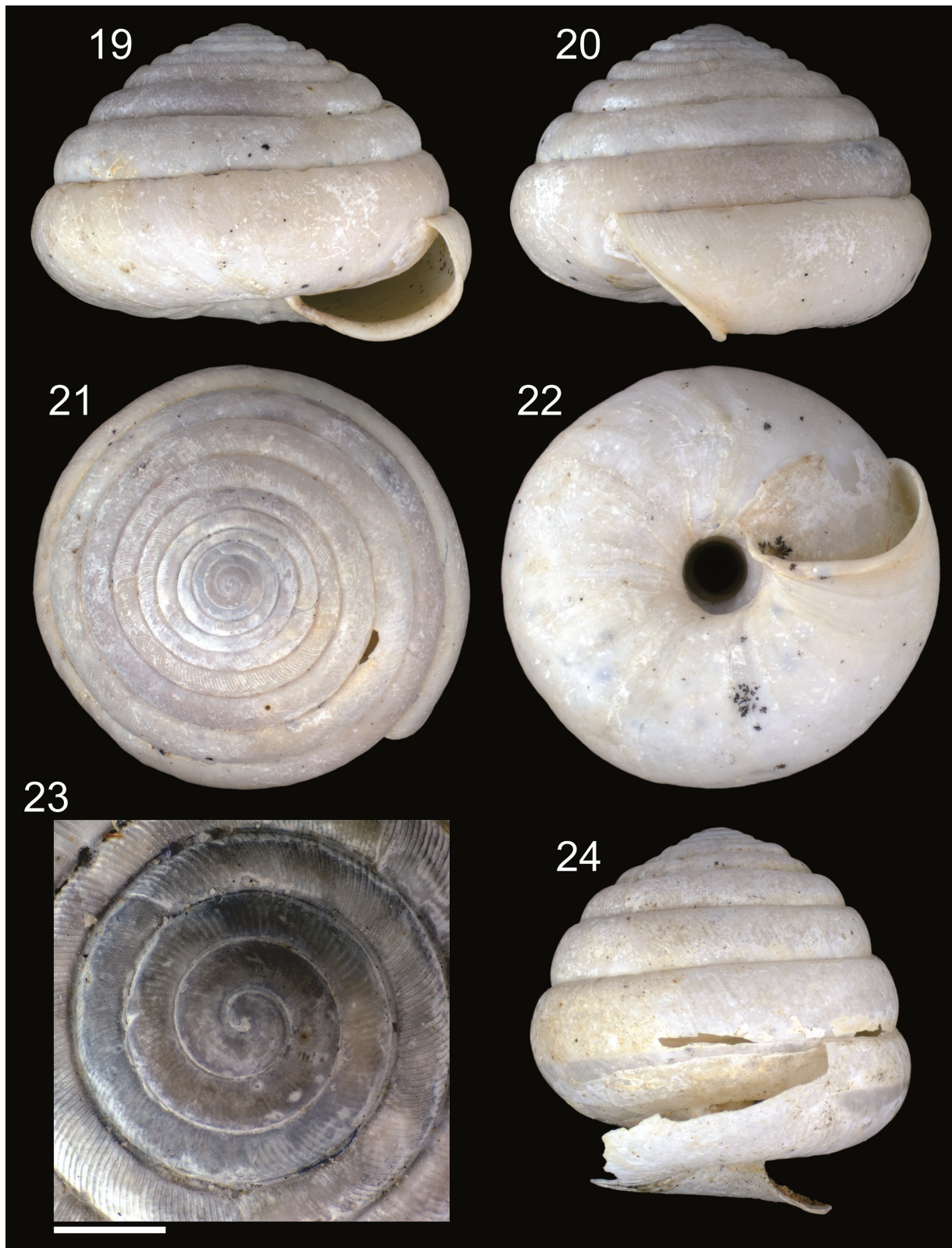
Figs. 19–24. Streptaxis megahelix sp. nov. – 19–23. Holotype, MZSP 124024 (H = 13.5 mm, D = 18.1 mm). The scale bar (= 1 mm) refers only to the close-up image of the protoconch and first whorls. 24. Paratype (fragmentary), MZSP 124024 (H = 16.0 mm, D = 15.8 mm).