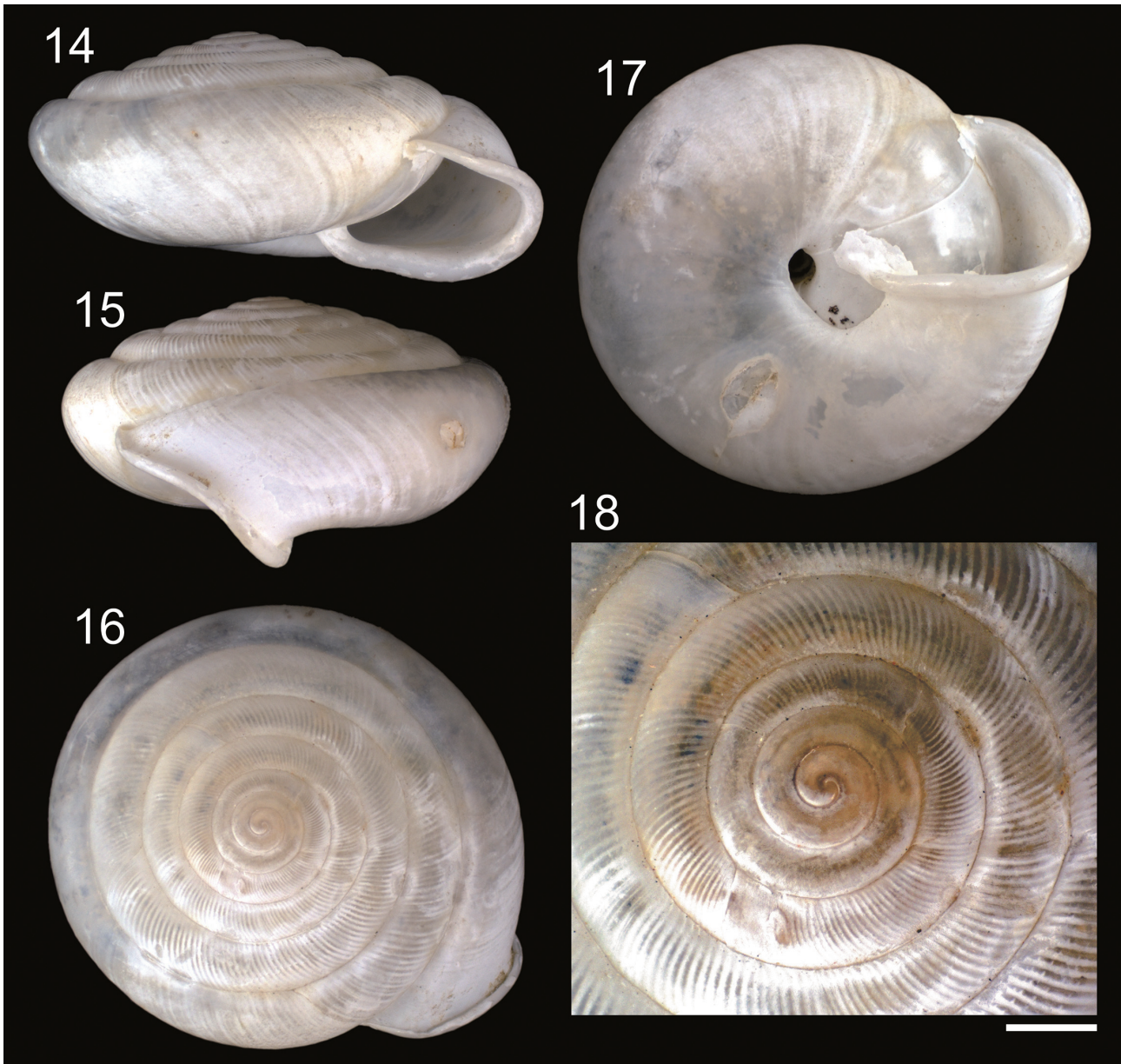
Figs. 14–18. Streptaxis leirae sp. nov. Holotype, MZSP 129247 (H = 6.8 mm, D = 13.5 mm). The scale bar (= 1 mm) refers only to the close-up image of the protoconch and first whorls.

growth). All of the present specimens were collected under bushes in a dune area, indicative of a dry sandy habitat for this species. The present record greatly extends the species' range to the east.